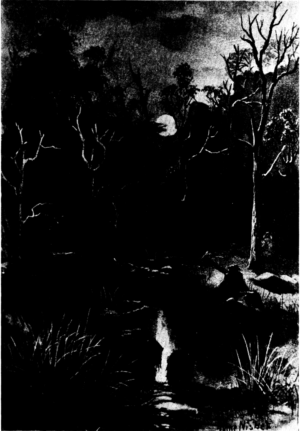
Frontispiece to Hume Nisbet, A Bush Girl's Romance (1894)