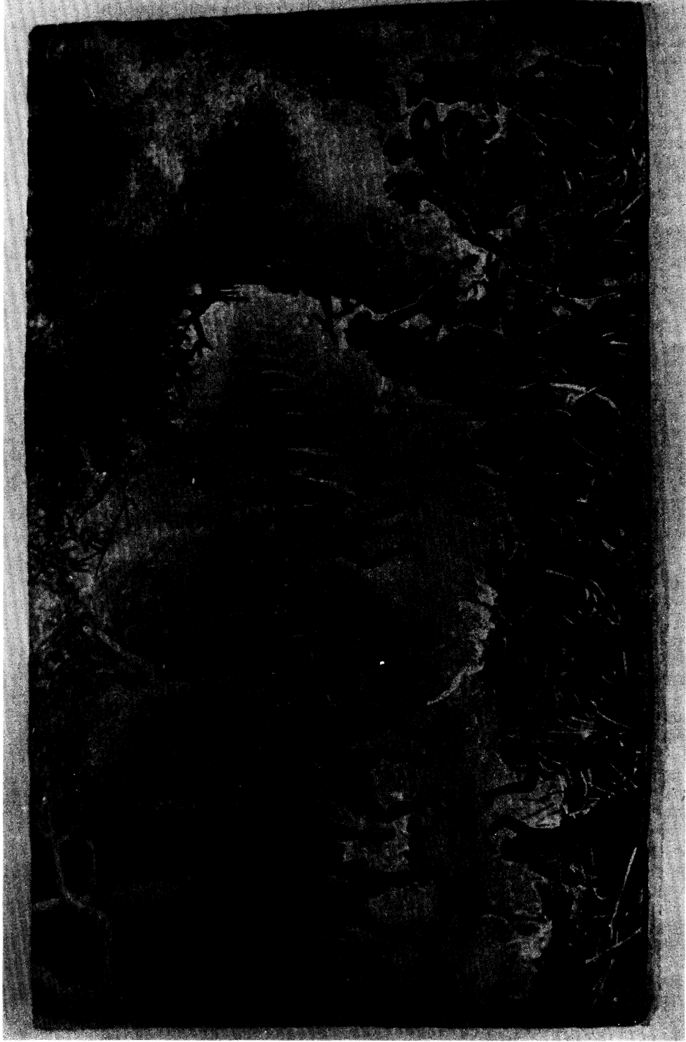
Illustration from Hume Nisbet, Reminiscences of Australian Early Life (1893)